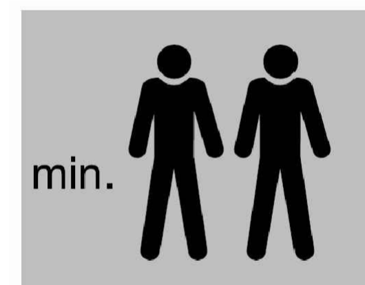
Two person Installation